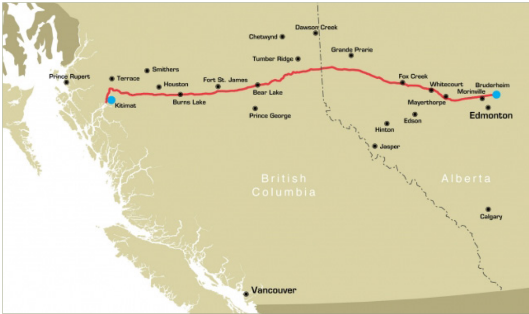
Northern Gateway Pipeline route

The economic benefit of the NGP lies in the additional income arising from building and using this new infrastructure: