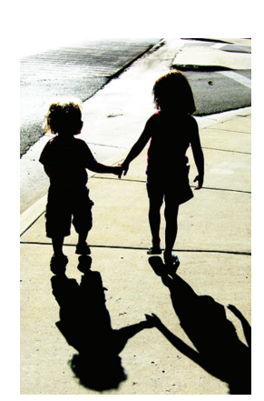
The story of child poverty is very much a story of low wages. The vast majority of BC's poor children live in families with some paid work. And in 2011, one-third lived in families where at least one adult had a full-time, full-year job.

The living wage calculation is based on the needs of two-parent families with young children, but would also support a family throughout the life cycle so that young adults are not discouraged from having children and older workers have some extra income as they age. In most communities, the living wage is enough for a single parent with one child to get by as well, and this was the case in Metro Vancouver until the 2012 living wage update. Importantly, however, the living wage since 2012 is no longer sufficient for a single parent with one child in Metro Vancouver. The problem is explained in more detail in a separate article which can be found at