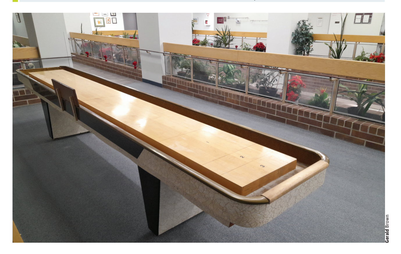
PHOTO 6 Shuffleboard table with view of second floor atrium plants.

them it's affecting, you can see some of them are getting a little depressed and things like that? You can sense that in them." (Tenant)