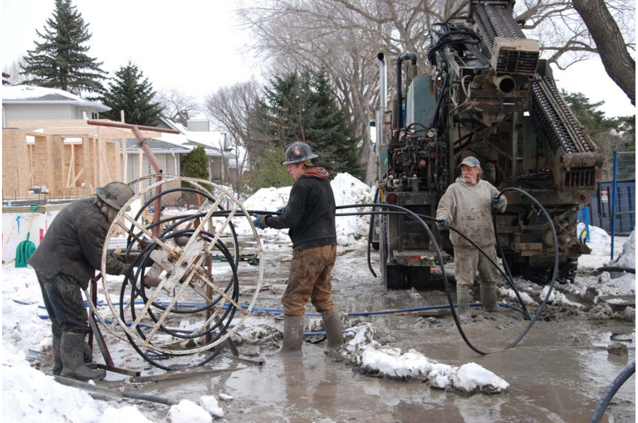
Geothermal energy installation provides growing employment in Canada.

We hope that providing information about the characteristics of green jobs, and about the relative employment potential of green policies, will help bolster the case for ambitious clean energy policies in Canada.